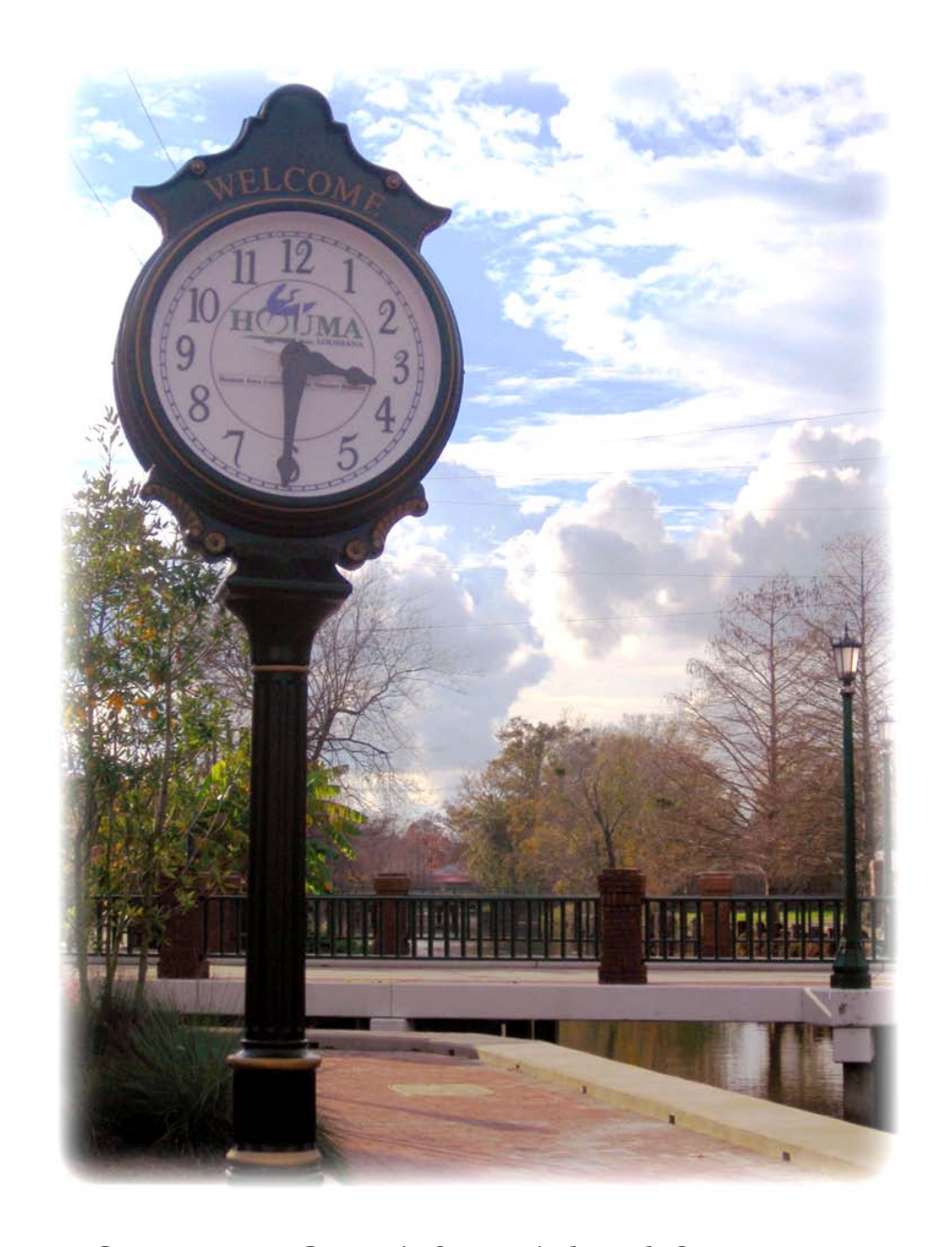
Terrebonne Parish Consolidated Government Houma, Louisiana