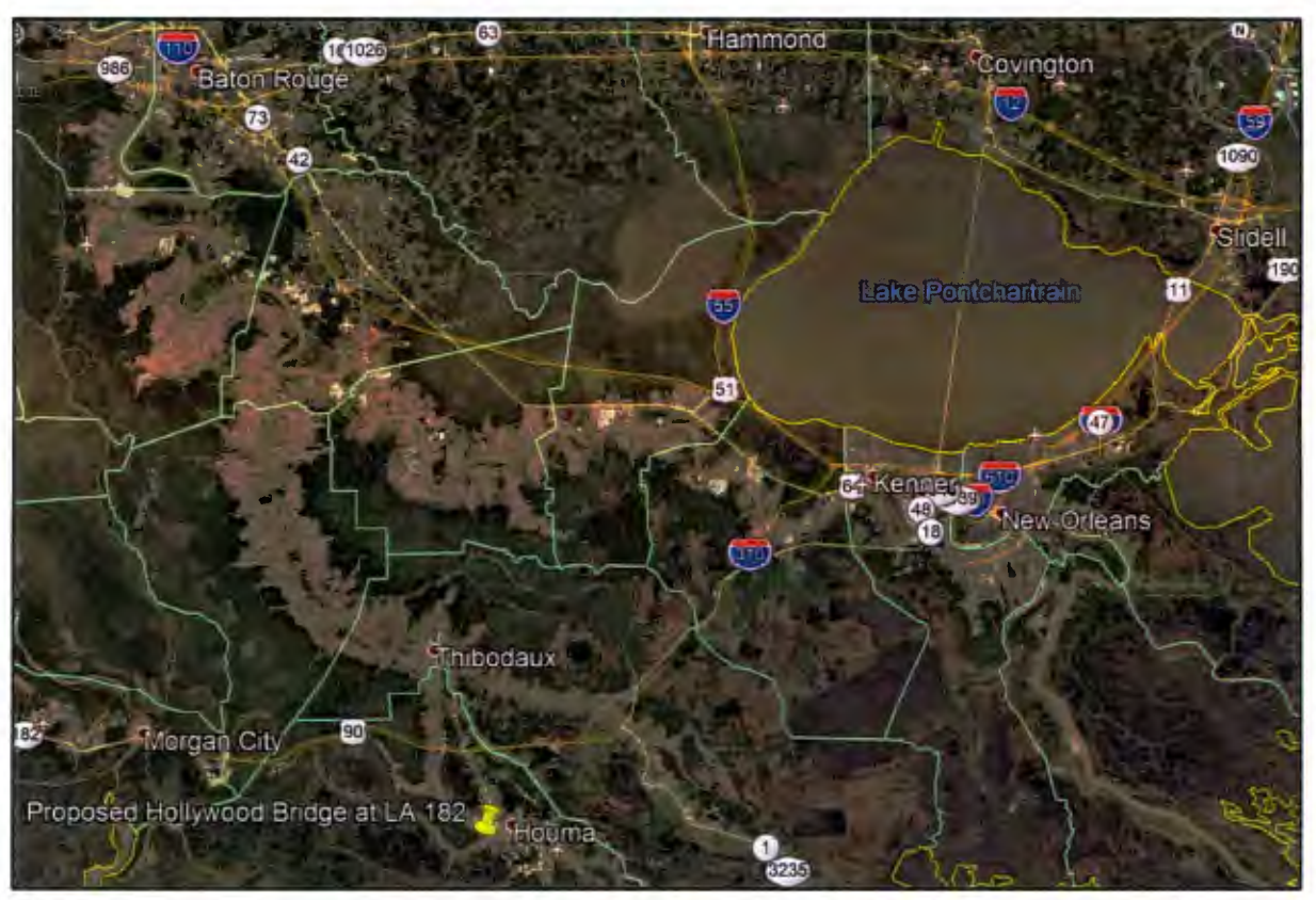
Vicinity Map of Proposed Hollywood Rd. Extension Bridge located in Terrebonne Parish