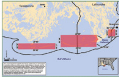
LOUISIANA DEPARTMENT OF WILDLIFE & FISHERIES RECREATIONAL FISHING