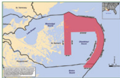
LOUISIANA DEPARTMENT OF WILDLIFE & FISHERIES RECREATIONAL FISHING