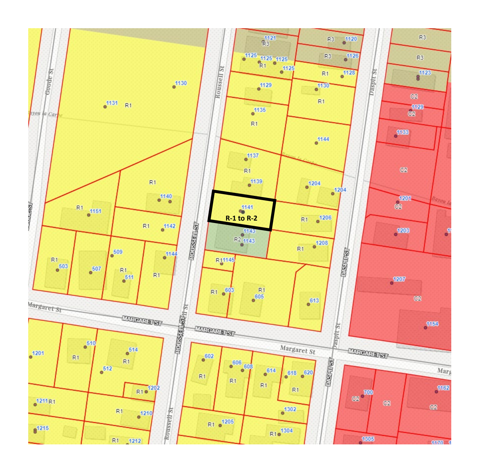
1141 Roussell Street Lot 2, Block 10, Breaux-Morrison Addition Rezone from R-1 (Single-Family Residential) to R-2 (Two-Family Residential) Tai Raymond, applicant